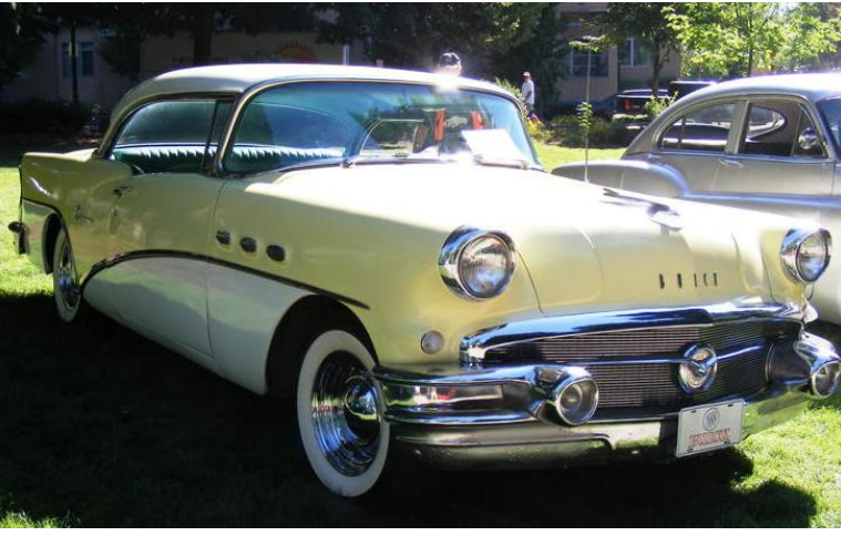
Show photos by Jack Wager