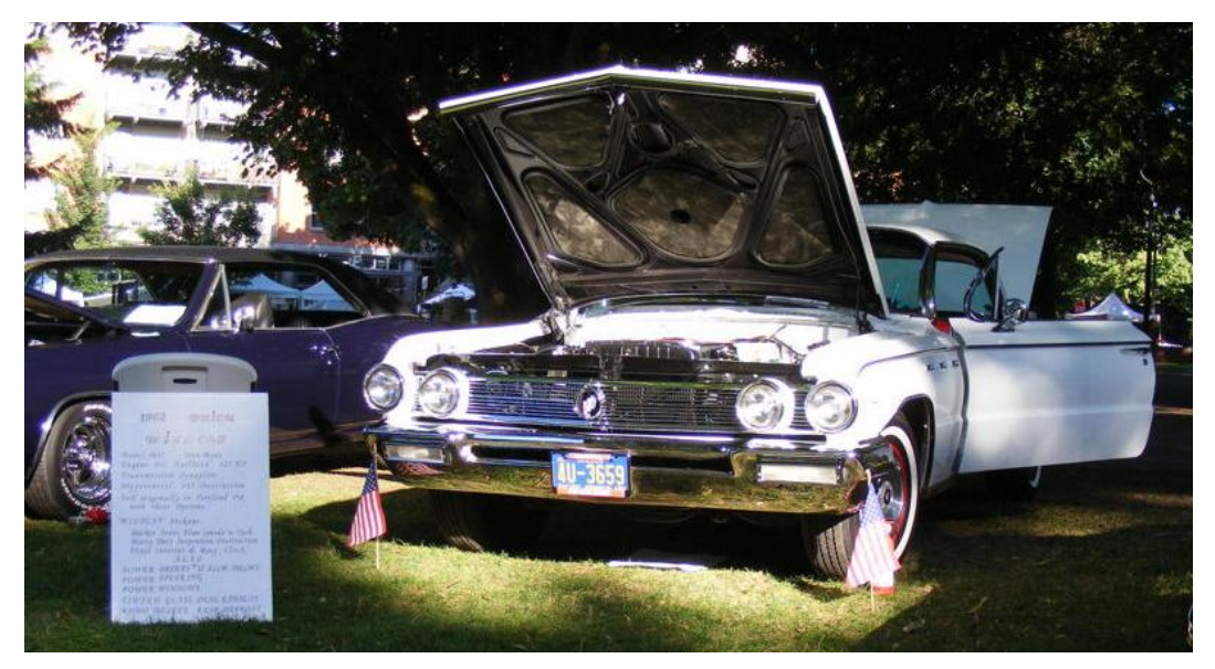
61-69 Steve Stabler's 1962 Wildcat